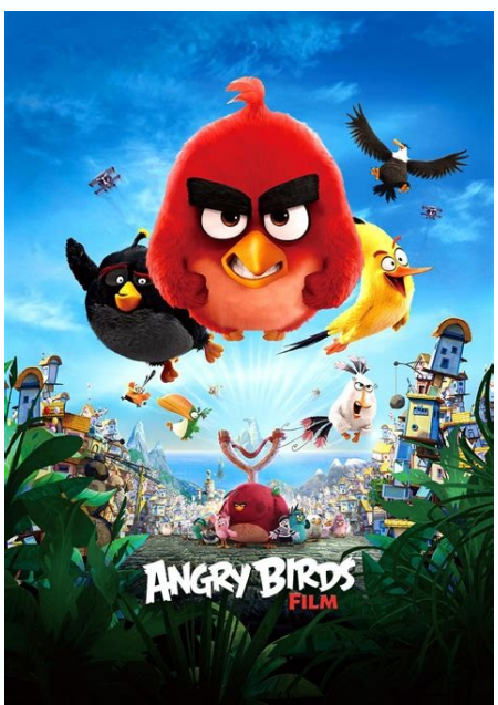
Tamil action movies 2019 full movie in hindi dubbed hd download. New tamil movies 2019 full movie hd download tamilrockers. Tamil hd full movie download 2019. Thiruttumovies 2019 tamil full movies hd download. Cartoon movies in tamil dubbed full hd free download 2019. Tamil dubbed hollywood movies full movie hd 2019 download tamilrockers. Tamil hd movies 2019 full movie download tamilrockers.